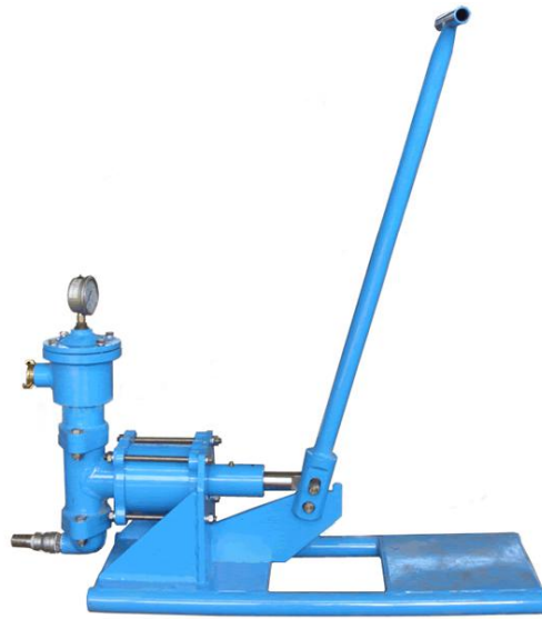
AGP-10H Hand Grouting Pump Structure drawing